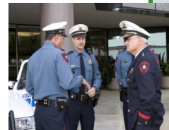
Constables work with HPD to fight crime in our community.

These officers make our community's safety their first priority and we are deeply grateful for their efforts.