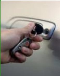
Keep your car locked.