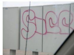
Graffiti removal and bandit sign reporting keep our community attractive.

Follow the District on Facebook, Twitter (@nnwmd), Linked In and Nixle.