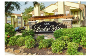
Our goal is to build a business community that works together to create prosperity through partnership.

There is still more going on. This is going to be an amazing year. Please work with us! The District is always looking for the input from the community and would love to see you at one of our meetings,