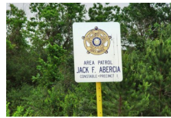
Security & enhanced city services are provided to support the business community.